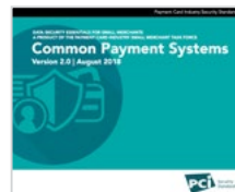
Common Payment Systems

The Council has established resources for COVID-19 updates, so please be sure to check our COVID-19 webpage and our blog regularly as this is a constantly evolving situation. You can also subscribe to our blog to receive email alerts.