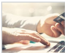
Best Practices for Securing E-commerce