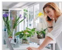
Protecting Telephone-Based Payment Card Data