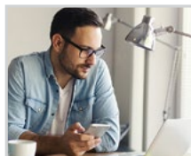
Protecting Payments While Working Remotely