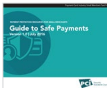
Guide to Safe Payments