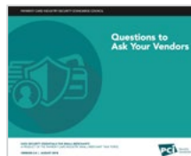
Questions to Ask your Vendors