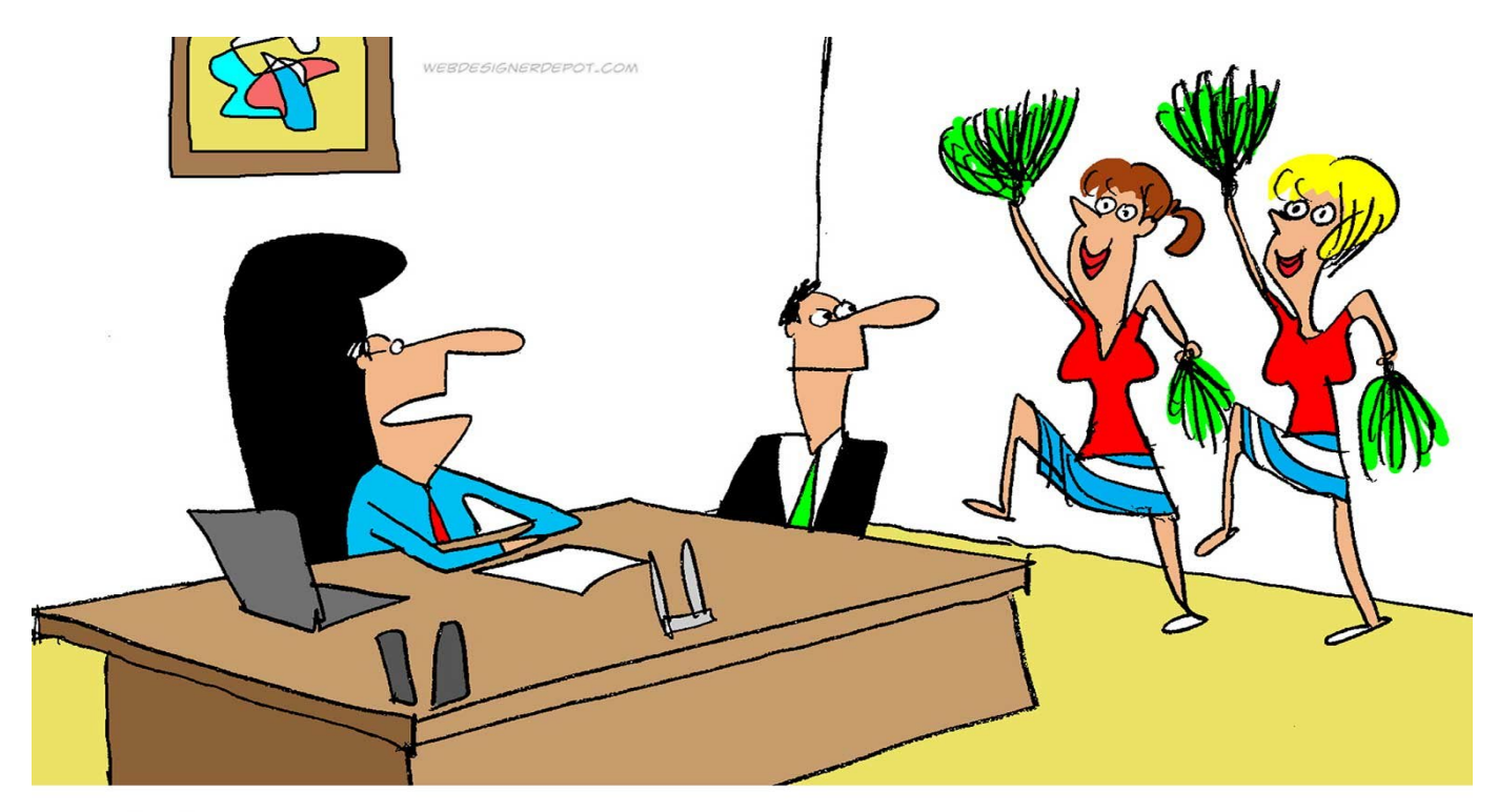
"WE LIKE TO PROVIDE EMOTIONAL, AS WELL AS TECHNICAL SUPPORT."